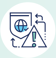
Cybersecurity Principles and Risks