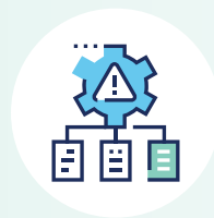
Incident Detection and Response